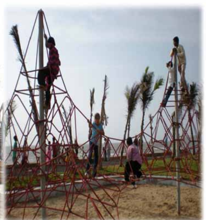
Harish Mahindra Park