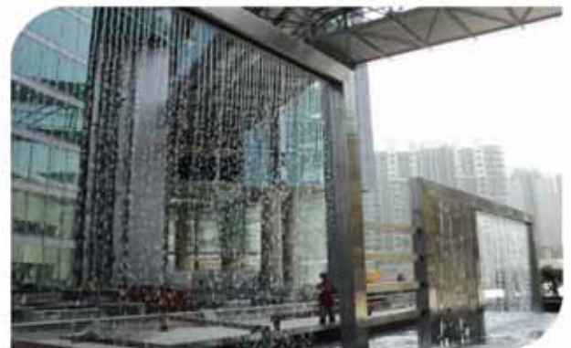
Brigade Sheraton Hotel