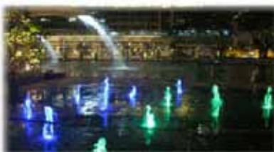
Brigade Interactive Fountain