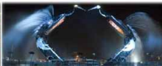
Crane Dance Fountain