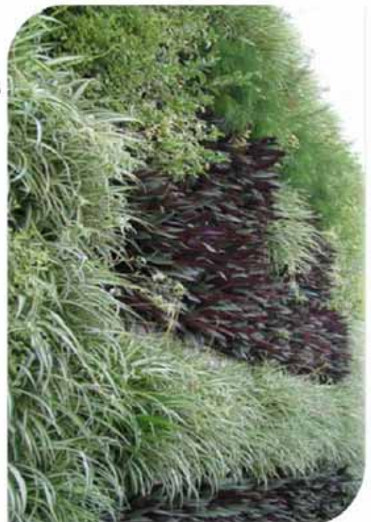
ZTC Show Room