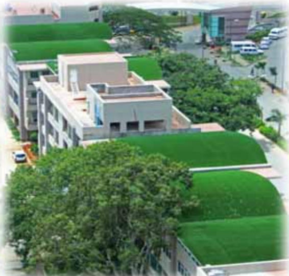
Brigade Metropolis - Shopping Arcade