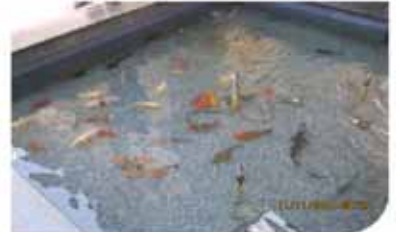
SS Malikarjuna Residence