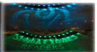
Flash Wall Fountain