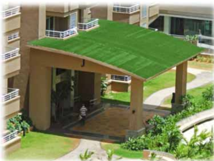
Brigade Metropolis - Entrance Canopy

ZTC International does the design and installation of artificial grass. This could also be one aspect of a landscaping project. ZTC International, in association with Pe-Ba, makes this possible.