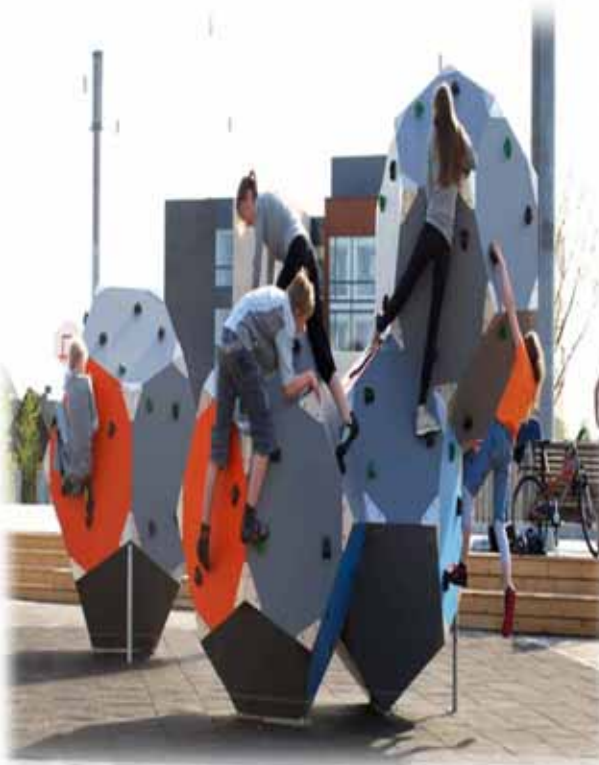
New Play Equipment - Bloqx