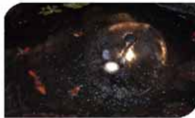
Prestige Laughing Water