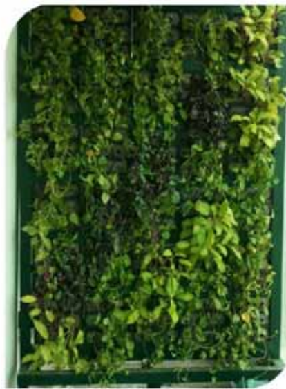
WTC - Brigade Gateway